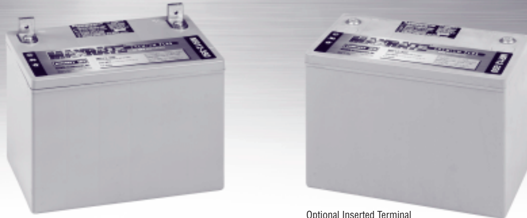
Optional Inserted Terminal Call Factory for Details