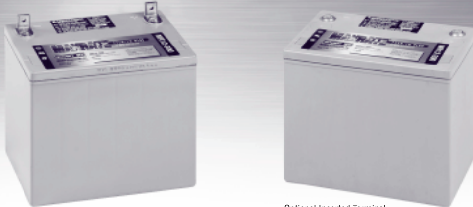
Optional Inserted Terminal Call Factory for Details